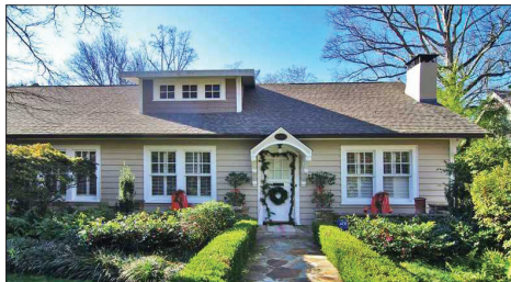
Atlanta, Georgia: Renovated, four bedroom, three bath Morningside home, Atlanta living at its finest. $859,000 Engel & Völkers Intown Atlanta +1 404-874-6357