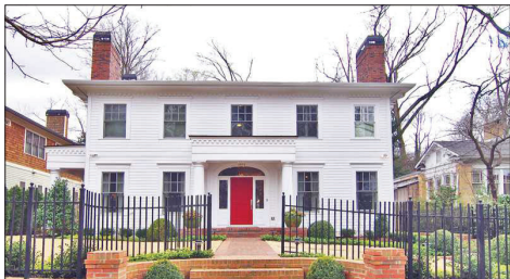
Atlanta, Georgia: Outstanding five bedroom, 4-1/2 bath home built in 2005 is the total package. $1,250,000 Engel & Völkers Intown Atlanta +1 404-874-6357