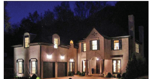
Atlanta, Georgia: New construction in coveted Morningside Elementary School District has five bedrooms and 5-1/2 baths. $1,295,000 Engel & Völkers Intown Atlanta +1 404-874-6357